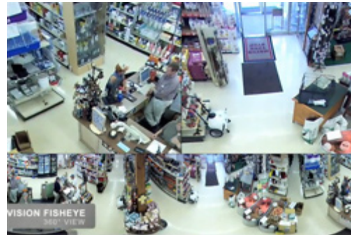
Dewarped Image: 2 PTZ views & 1 360 degree view